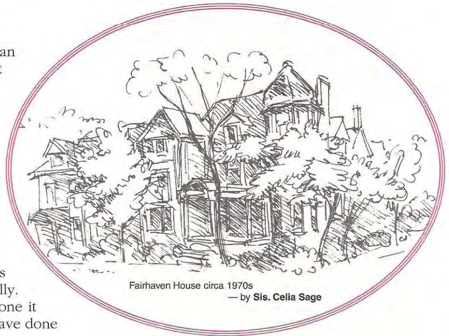
Fairhaven House circa 1970s

As the Gospel continues to be preached around the globe, the needs in the body of Christ continue to grow. These provide those of us in Canada, who have been so richly blessed, opportunity to demonstrate our love to our Lord who bought us. Avenues are readily open to support the work of the Bible Missions, and other Christadelphian foundations such as WCF. More recently, as the Truth has spread to Moslem countries, new brothers and sisters have faced mounting religious persecution and many have fled in fear of their lives. Today Christadelphian refugees who have lost "houses, family or lands for Christ's sake" are seeking resettlement in a safe haven.